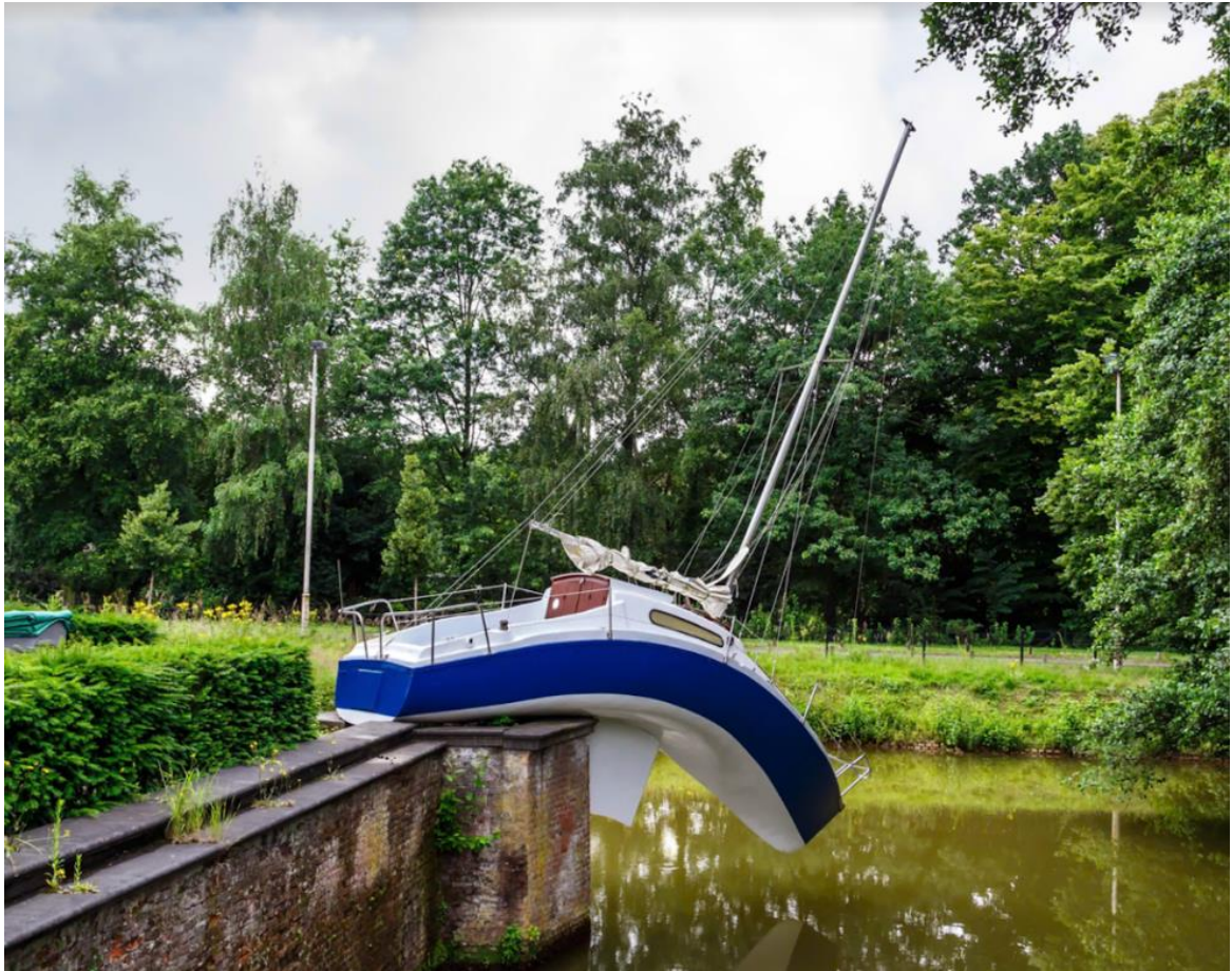
Interesting exhibit at Middelheim Museum Antwerp (via Nigel McCarter)