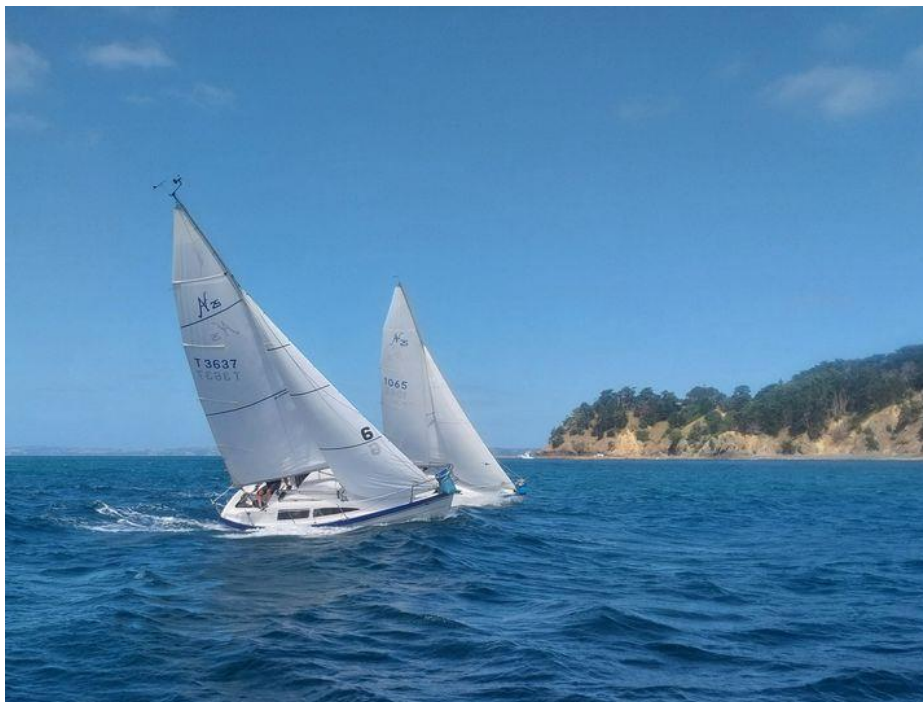
Endurance and Suzie rounding Rakino Island, as captured from the foredeck of Escargot in the Gulf Classic 2024

Gulf Classic 2025 will be held on the weekend of 15-16th March 2025