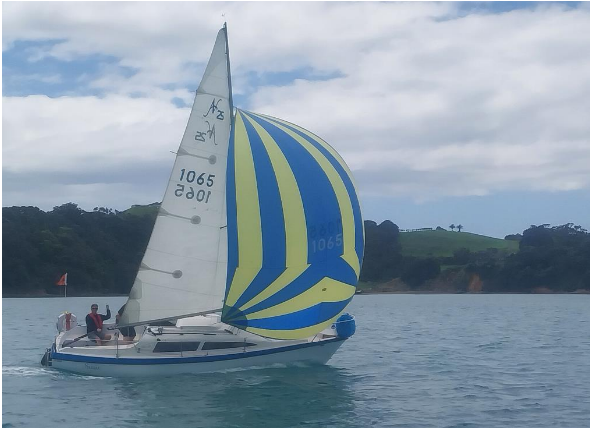
Suzie looking great as she sails to victory in Passage Race 1