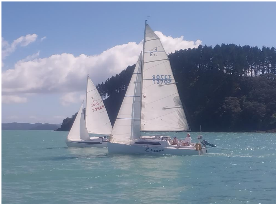
Pangur Bán and E Type 2 just after starting Passage Race 1 on Labour Weekend