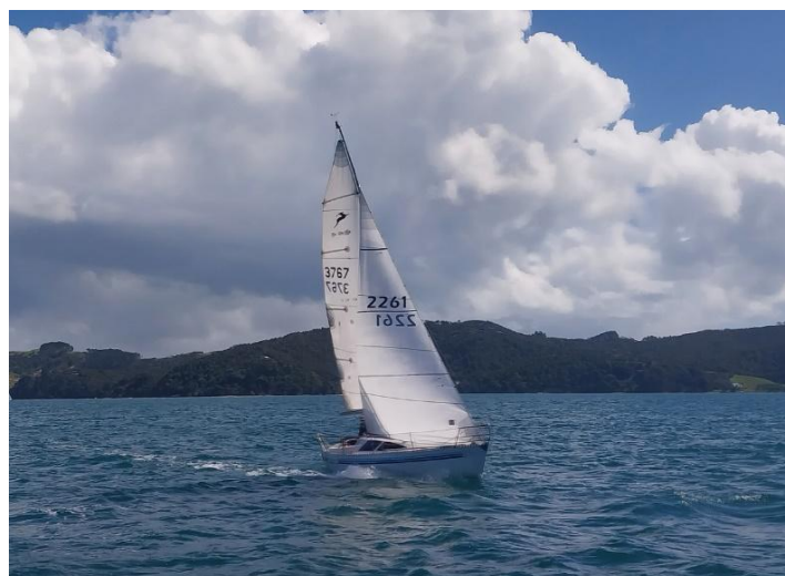
Escargot shortly after crossing the finish line