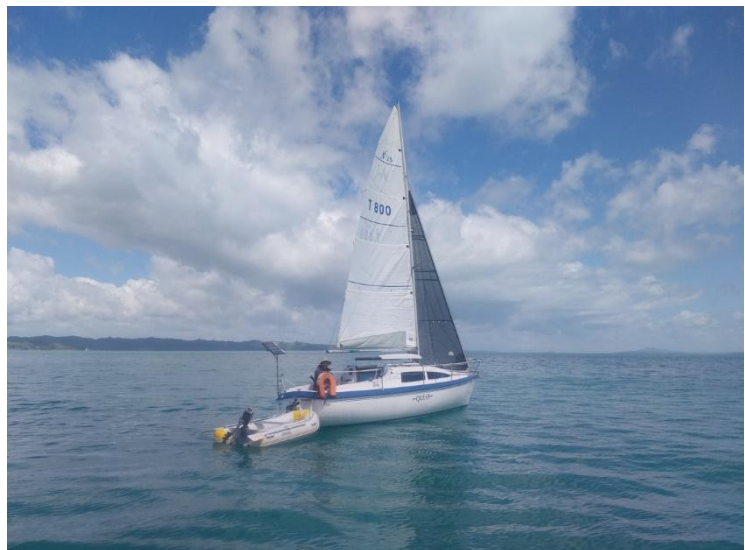
Quest very nearly becalmed

All was going well during the first leg towards the eastern marine reserve buoy, with some jostling for position and luffing going on between Hue & Cry and Perpetual Motion . However as we neared the Waiheke Channel, most of us sailed into a wind hole, which allowed Suzie and E Type 2 at the front to make some serious gains as they rounded the marker into the second leg, towards the Rocky Bay buoy.