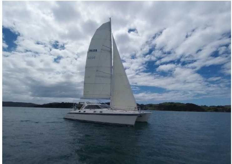
Royle Flush majestically cruising past

At last we rounded into Waiheke Channel, and at last were able to outsail Portfolio and also INXS , who had joined us from Kawakawa Bay.