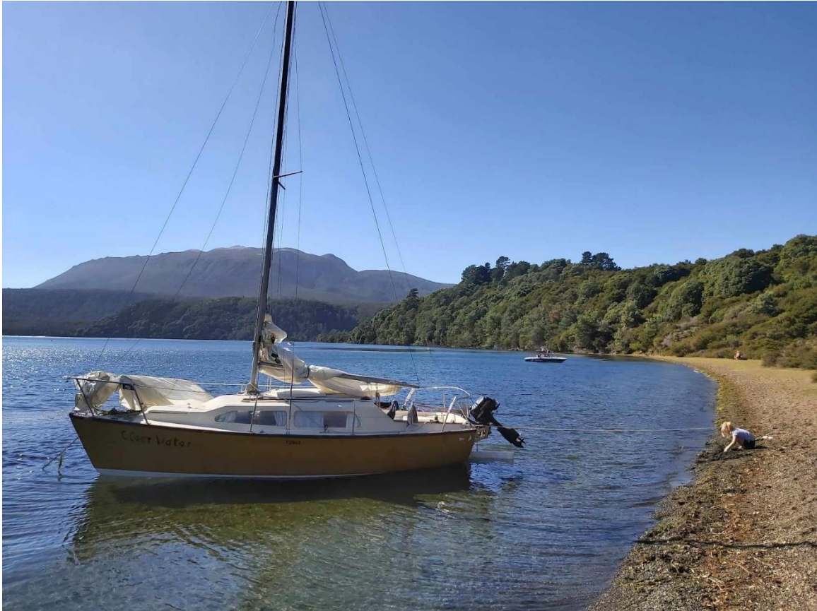
Sven's "new" boat, the Merlin 6.1 - "Clear Water"