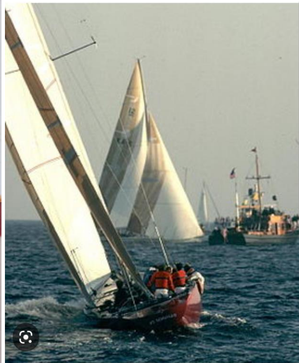
The finish line and gun.