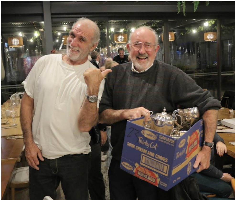
Jim needs a bigger box!

The story behind the special trophies and awards are many and varied.