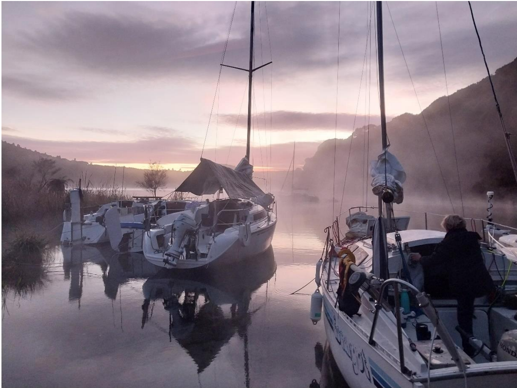
Aperitif, Suzie, INXS, Sugarshack and Escargot on King's Birthday morning on Lake Tarawera