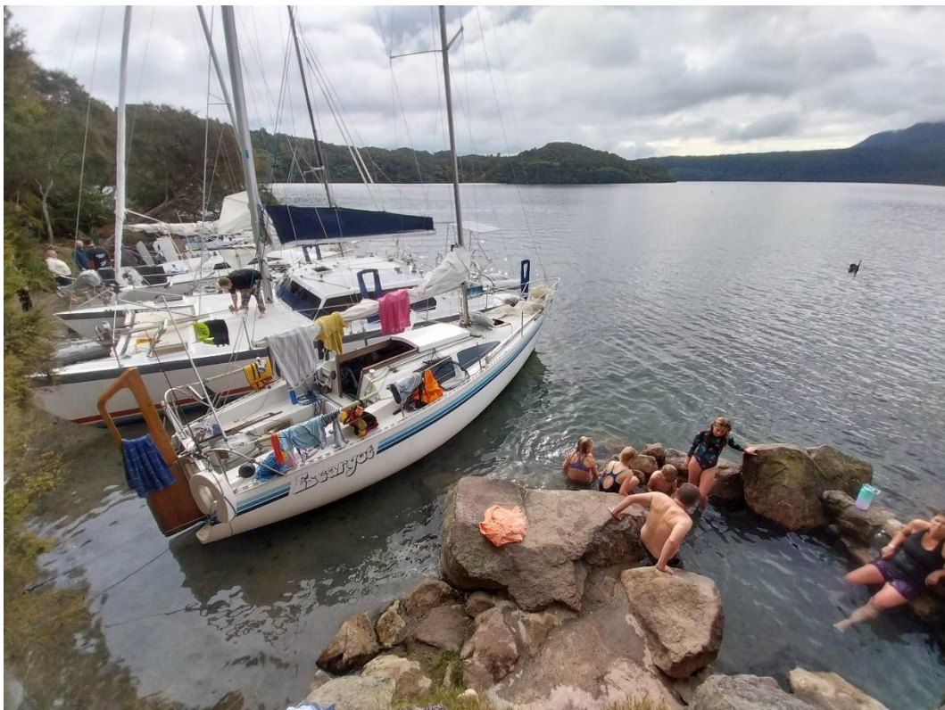
Suzie, Aperitif, Ngatahi and Escargot at Champagne Pool. Where else in the world can you park your boat in warm water, within metres of a scalding hot free spa pool?