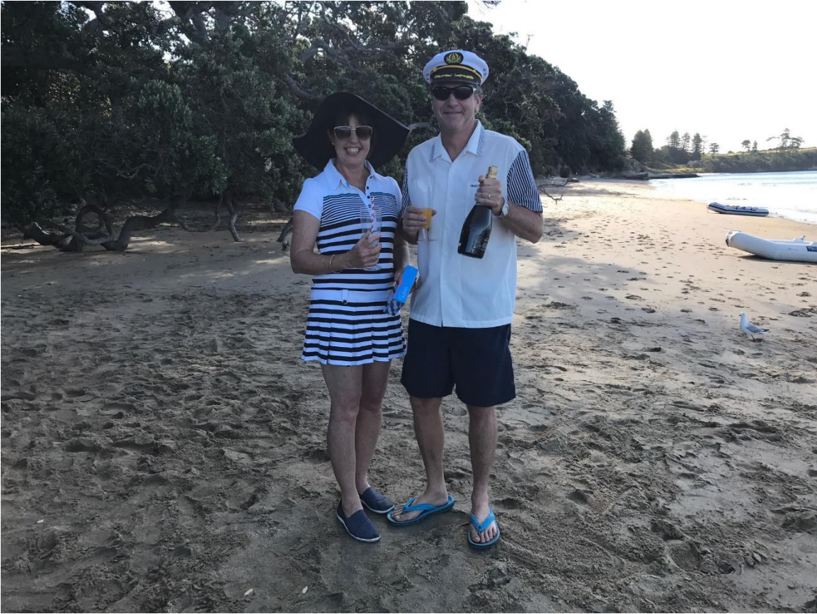
And a very fine commodore and commodoreess winning the cocktails contest and popping the cork on the markay vue.....