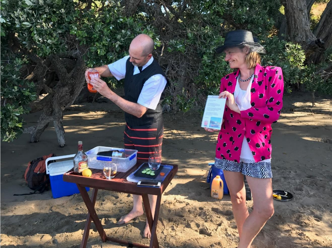
And do we really want this sort of shenanigan going on .....doesn't this bring back a few memories – Valentines day Cocktail party 2017