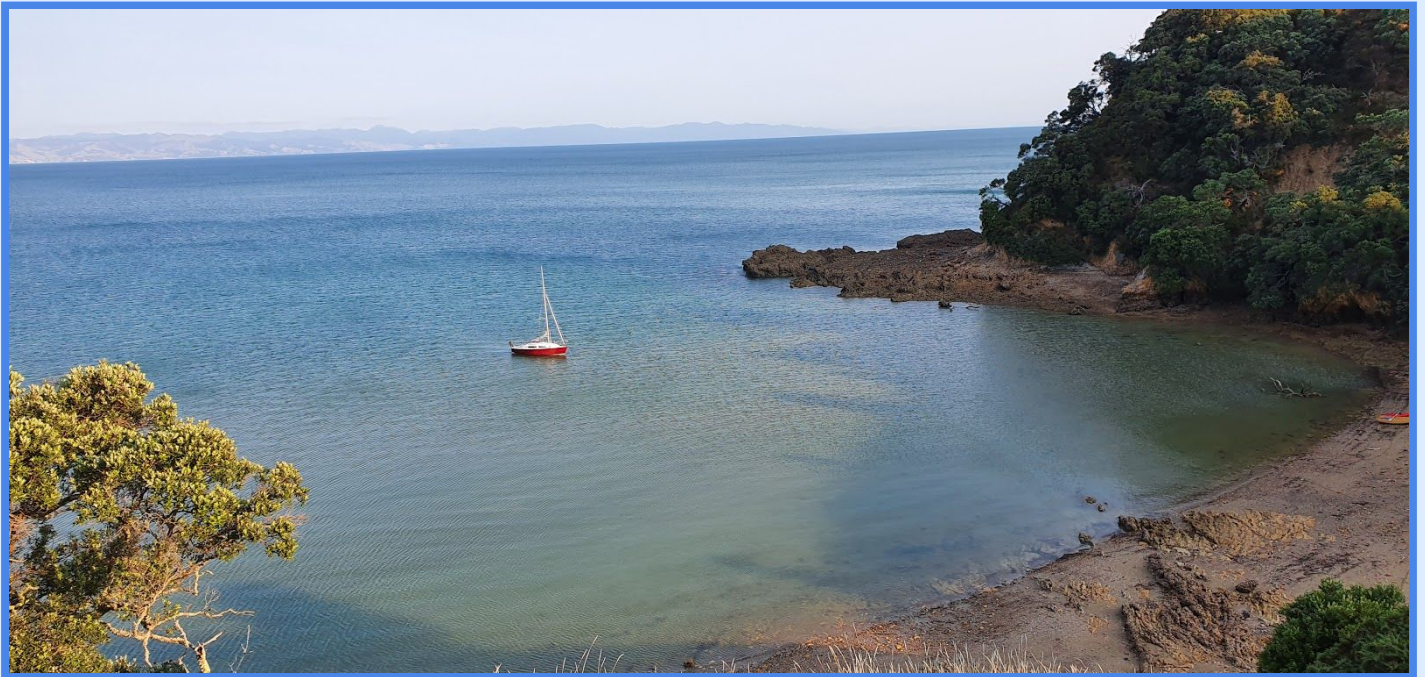
Kittiwake, Bryants Bay, Ponui Island