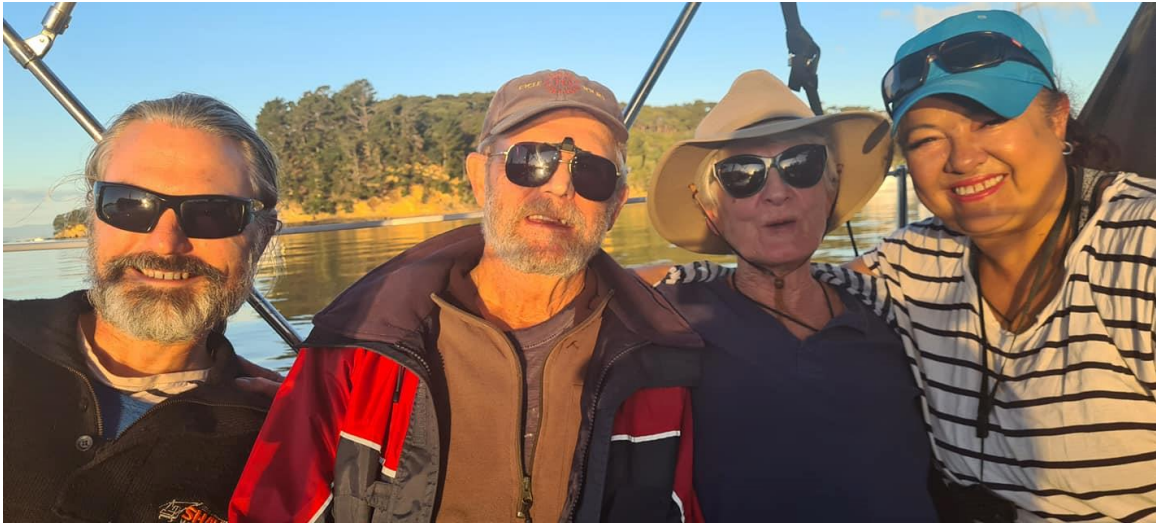
A bunch of our young owners out on the water on a lovely sunny day in mid-May (Young 77's that is)