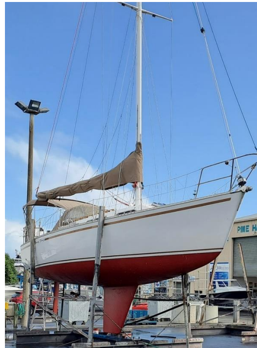
'Passing Fancy' looking good