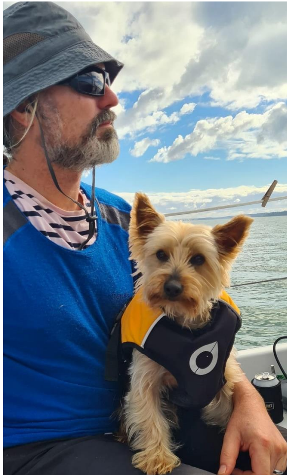
And what would sailing be without having the skipper along! See if you can guess which one is the skipper